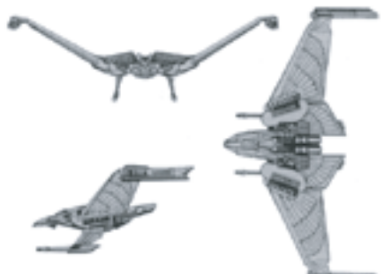
V-30 (Winged Defender)