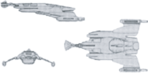
T-5 Throne Seeker

SPECS Class: Medium Ship In Service: 2254 Point Value: 275 Ramming Factor: 50 Warp Delay: 8 Turns