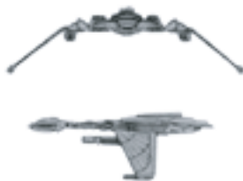
T-10 (Bright One)

FORWARD HITS 1-3: Deflector Shield 4-5: Lt Photon Torpedo 6-8: Medium Disruptor 9-10: Light Disruptor 11-17: Structure 18-20: PRIMARY Hit