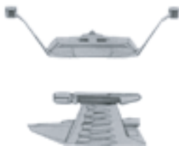
I-4A (Seeker of the Hunt)