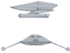
T-2 (Death Talon)