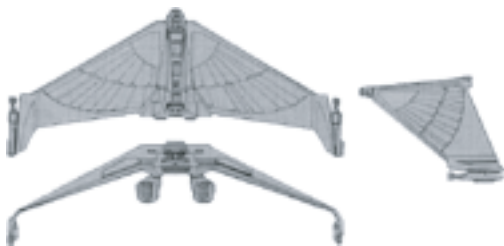
V-4 (Wing of Vengeance)